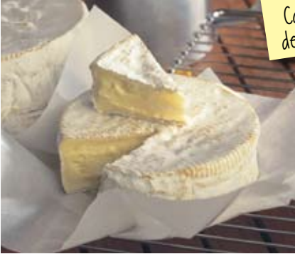
Camembert de Normandie

When you indulge in the cheeses and dairy products of the Normande region, you're savoring over 1000 years of expertise. It's quite possible William the Conqueror, Duke of Normandy, cut his teeth on early versions of some of these delicacies.